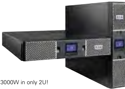
3000W in only 2U!