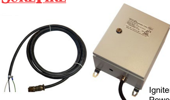
Igniter HV Cable