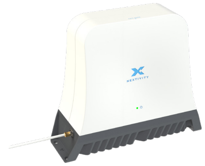
CEL-FI CONNECT C41